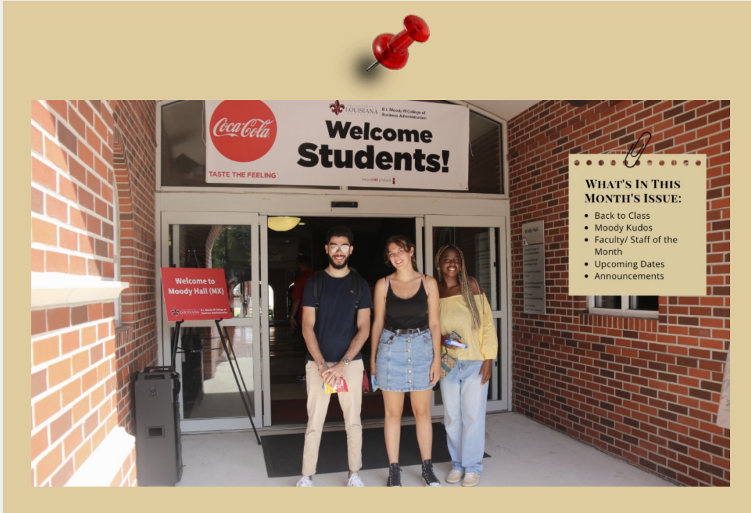
Students coming back to Moody Hall for the start of the Fall 2023 semester. We missed you!