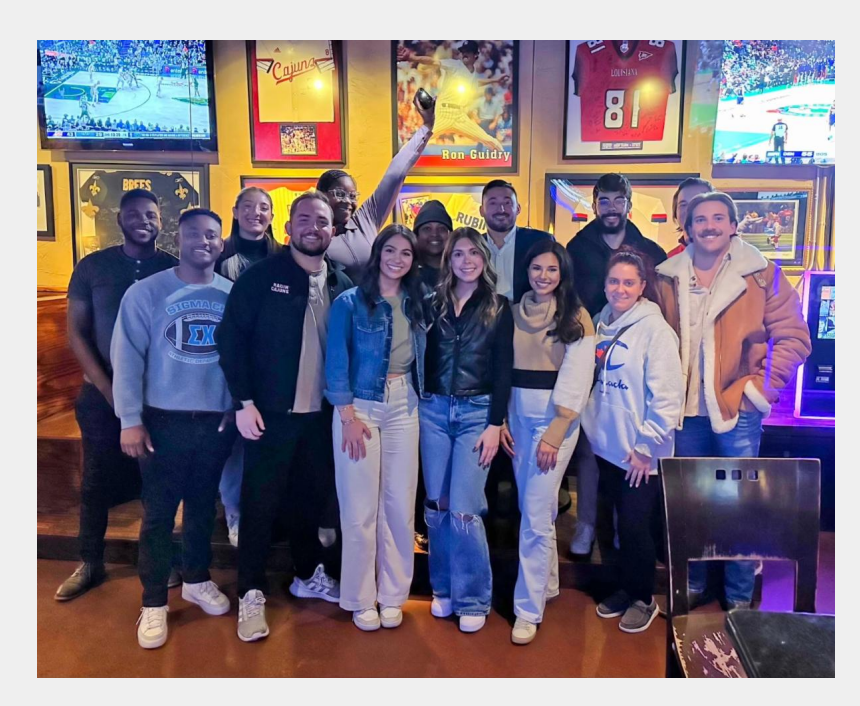
Check out all the upcoming MBAA events for the Spring 2024 Semester below and scan the QR Code to join the MBAA Group Me!

The MBA Association also hosted its first social of the semester at Corner Bar in Lafayette. - See the picture below .